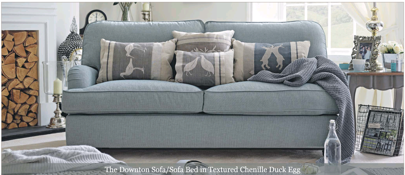
The Downton Sofa/Sofa Bed in Textured Chenille Duck Egg

I inherited this from my late mother. I grew up surrounded by Victoriana and learnt to walk hanging on to the legs of my Mum's grand piano