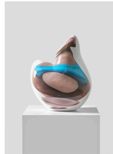
Zygotes (White wavy form), 2020. Resin, ink, and lacquer. 65 x 30 x 30 cm.

NH: Apart from the collaboration with Louie Banks, yes, I took all the photographs.