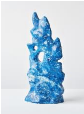
Zuza Mengham Knip II Jesmonite, Marble 31.5 x 17 x 10cm (HWD) 2019