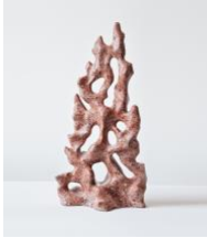
Zuza Mengham Untitled Jesmonite, Marble 52 x 32 x 23 cm (HWD) 2019