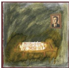
Ruyin Nabizadehhighi I Wai Him to Know: I wai him to know 2016 Collage on paper 20 x 20 cm