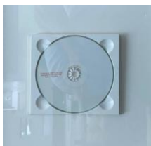
Katie Paterson Earth moon earth (moonlight sonata reflected from the surface of the moon) TRT: 7:25