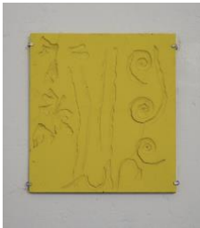
Ruyin Nabizadehhighi My Life as a Succulent Pattern 2018 Cast composite, gravel, marble dust , pigment 46 x 42 x 1.5 cm