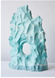
Zuza Mengham Untitled Jesmonite, Marble 47 x 30 x 17cm